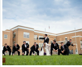
Joe Flacco's amazing wedding photos are out on the Internet