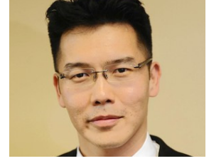
Hernias in women can be hard to diagnose